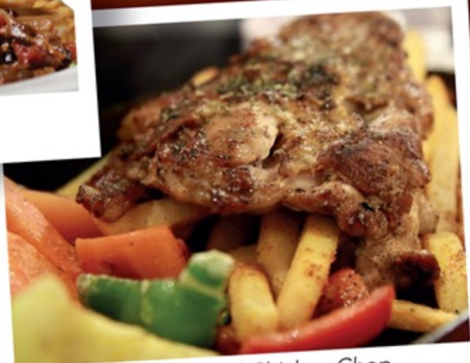
AM06. Grilled Chicken Chop Served with Black Pepper Sauce RM 26.95