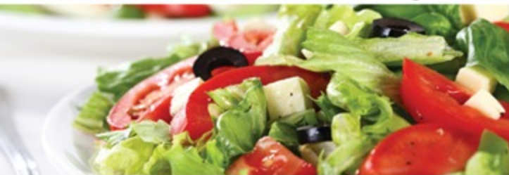
AL06. Garden Green Salad with Balsamic Vinaigrette sauce RM 15.95