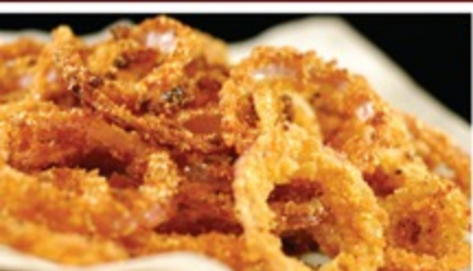
SN010. Onions Rings RM 16.50