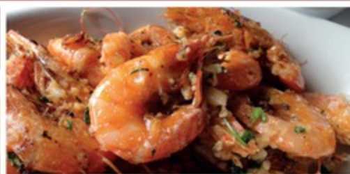
SN02. Sautéed Garlic Shrimp served with Thai Chili sauce RM 21.00