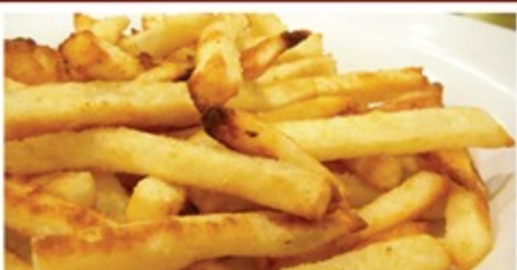
SN011. French Fries RM 15.50