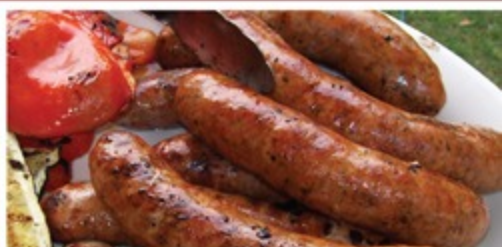
SN06. Black Pepper Chicken Sausages RM 19.50