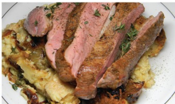
AP05. Smoked Duck Breast. RM 35.00 Served with Mashed Potato, Vegetable sauteed & Mustard Cream Sauce.