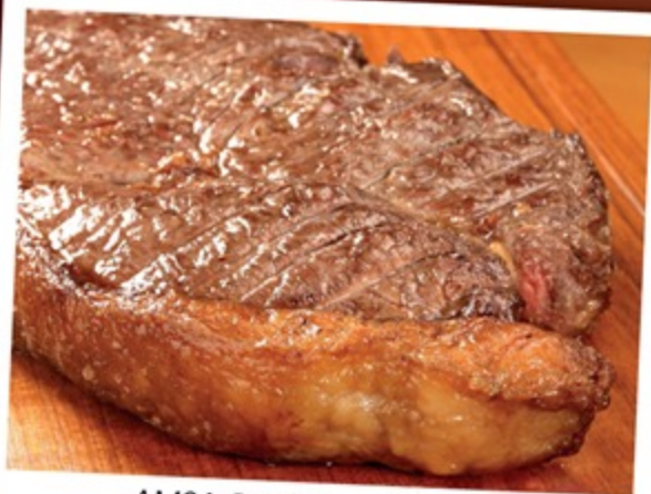
AM04. Beef Rump Steak - AUS Picanha ( 300g ) RM 39.95