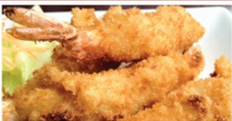
SN05. Shrimp Tempura served with Soy sauce RM 21.5