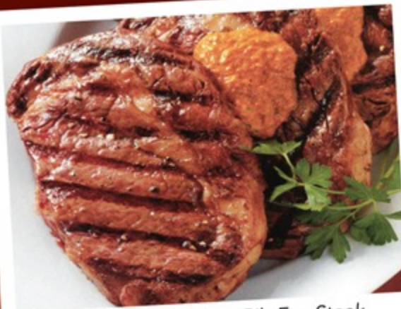
AM2. Grilled Prime Rib Eye Steak - AUS ( 250g ) RM 59.50