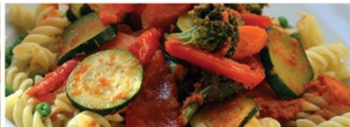
AL05. Vegetarian Pasta RM 32.00