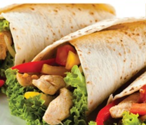
AP01. Chicken tortilla wraps with Thousand Island Sauce. RM 19.95