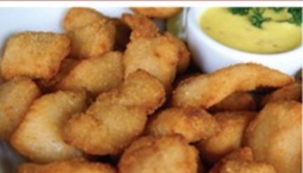
SN04. Deep Fried Fish Fillet with Tartar sauce RM 18.50