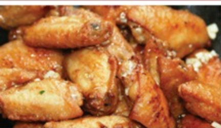
SN03. Deep Fried Chicken Wings served with Thai Chili sauce RM 19.50