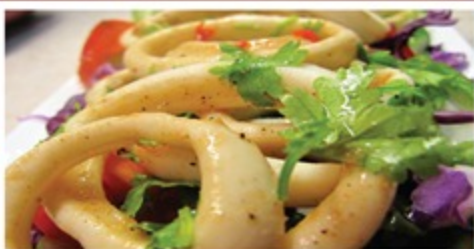
SN08. Sautéed Calamari Rings with Pepper RM 17.50