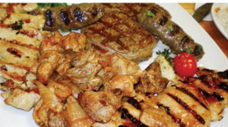
AP04. Mix BBQ Platter. RM 45.95 Special platter with Beef, Shrimp, Chicken Sausages, Fish, served with Potato wedges, Butter rice & Vinaigrette sauce.