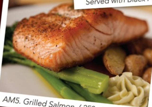
AM5. Grilled Salmon ( 250g ) RM 39.95