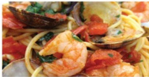
AL02. Spaghetti Marinara RM 32.95