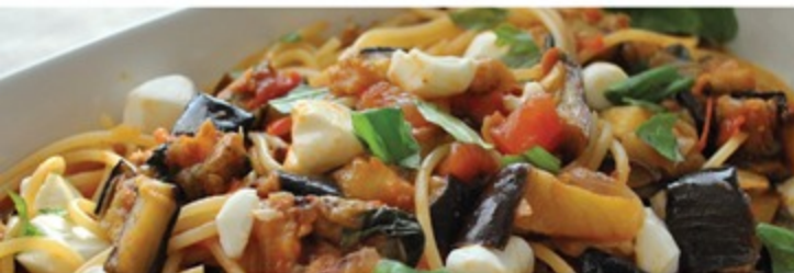
AL04. Pasta with Tomatoes and Mozzarella. RM 32.95