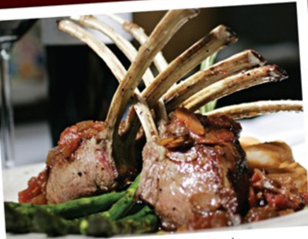
AM5. Grilled Lamb Rack - AUS ( 350g ) RM 75.95