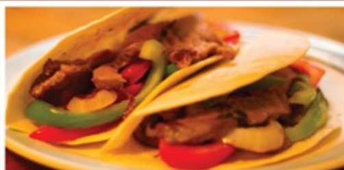
SN09. Sautéed Lamb Fajitas RM 21.50