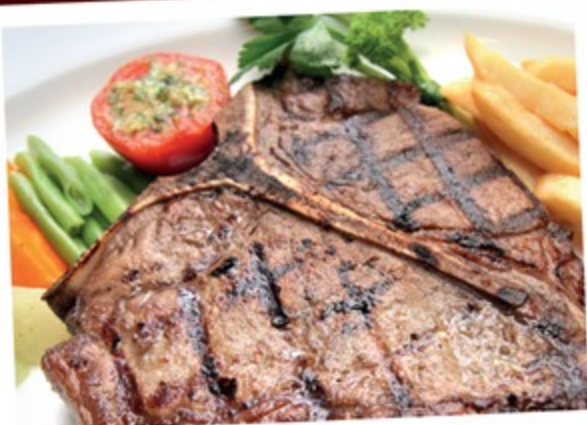
AM1. T- Bone Steak - AUS ( 450g ) RM 57.95