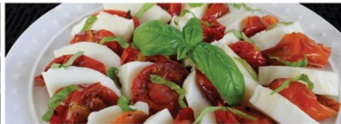
AL09. Caprese Salad With Buffalo Mozzarella RM 19.95