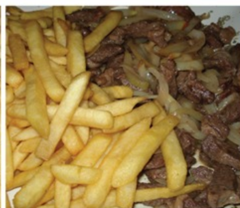
AP02. Fried Jerky Beef with onions & Fries (Carne de Sol). RM 25.95