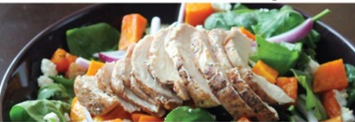
AL08. Smoked Duck Breast Salad with Vinaigrette Sauce RM 21.95