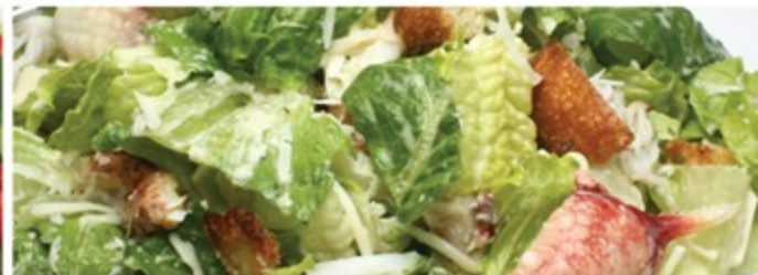
AL07. Romaine Salad with Caesar Dressing RM 15.95