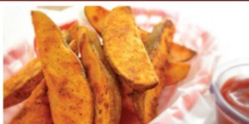
SN012. Potato Wedges RM 16.50