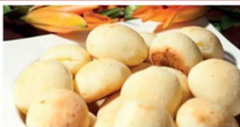
SN01. Brazilian Cheese Bread (12pcs) RM 20.00