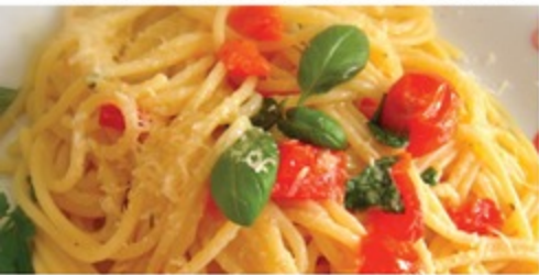
AL01. Spaghetti aglio olio RM 27.95