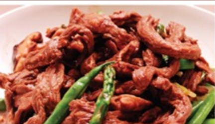
SN07. Deep Fried Beef served with Lime sauce RM 18.50