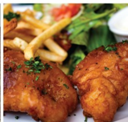
AP03. Fish & Chips served with Green Salad & Tartar sauce. RM 23.95